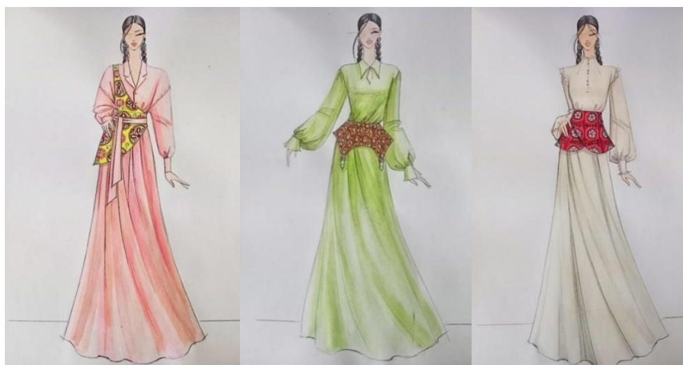
Figure 3. Sketches of women's suits with «basque» ornamented with prints

These fabrics were developed for use as «basque» in women's suits, shown in Figure 3. The color design and texture of the materials, «basque» cutting features as the main decorative element and the ornamented ethnic print are of great importance in the compositional design of the costume. The integrity and scale of the composition, the imagery and color of the costume is achieved through a harmonious combination of ethnic elements.